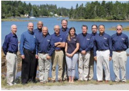
Meet the Nautel Sales Team >