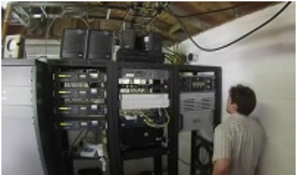
KQNG Installs a J1000 >