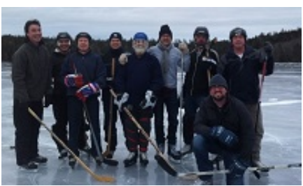
Nautel Pond Hockey >