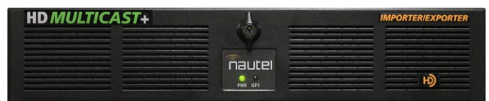
HD MultiCast+ Importer/Exporter

In addition to the generous employment options facilitated by Nautel's software-based air chain, broadcasters can also choose to implement their HD Radio transmission using a traditional external importer/exporter approach combined with Nautel's engine card.