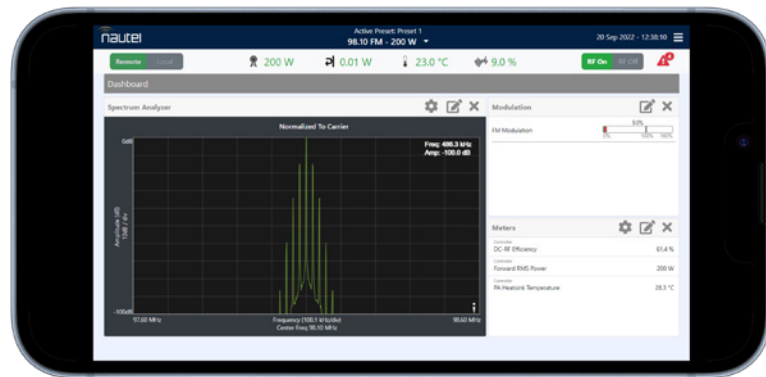
Advanced User Interface (AUI)