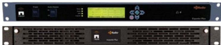
Exporter Plus (top) and Importer Plus (bottom)

Additional digital channels can be added by deploying an optional Nautel Importer Plus and appropriate iBiquity Corporation licenses. The Nautel Importer Plus codes the secondary program and data services of an IBOC transmission including digital channels two to four and passes its output to an Exporter. A convenient user interface permits the selection of IBOC service modes and partitioning of IBOC signal bandwidth for a variety of audio multicasting. Both the Importer Plus and Exporter Plus are 1U rack mount 100% solid state devices that provide outstanding reliability.