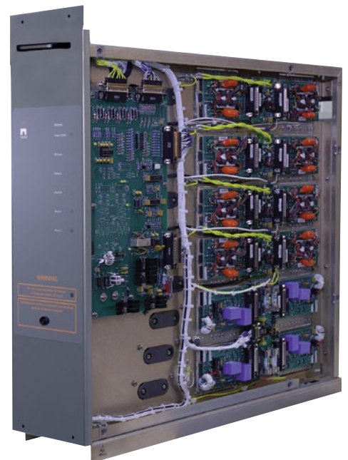
XR Series Power Module

The building block for the XR3 and XR6 transmitters is a power module integrating multiple RF amplifier units. The individual RF amplifiers and modulator units are connected to the power modules using plug-in industry standard "D" connectors and bolted directly to a heatsink. Servicing consists of simple exchange, using only a screwdriver. Component level repair can be performed at a workbench or near the transmitter using a convenient test cable that provides all test signals from the host transmitter.