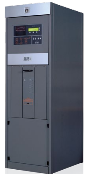
XR3 AM Transmitter

The XR3 and XR6 transmitters are built to stay on the air without human supervision. The transmitters maintain rated power with 100% modulation even with an antenna mismatch of up to 1.5:1 VSWR. With more extreme VSWR, power is automatically reduced to a safe level. A unique circuit dynamically stabilizes power output against AC line voltage variations. After an AC power loss, overvoltage or RF overload, prior operating status is automatically restored. The XR3 and XR6 are ideally suited for unattended, automatic or remote controlled operation.