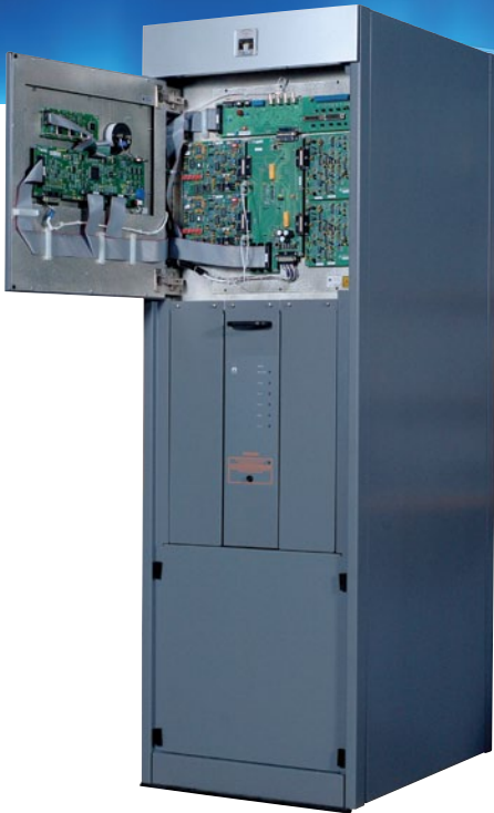
XR6 with Door Open