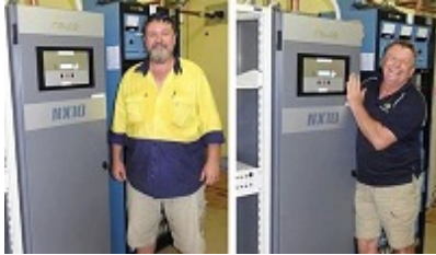
Nautel NX10 at 4RK in OZ >