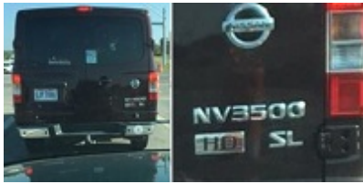
Mobile NV3500 HD transmitter! >