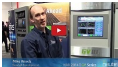
GV Series Introduction >