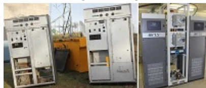
Old RCA BTF20E transmitters replaced with NVIt7.5's, NSW, Australia >