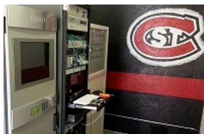
BDR User Report: First GV10 on