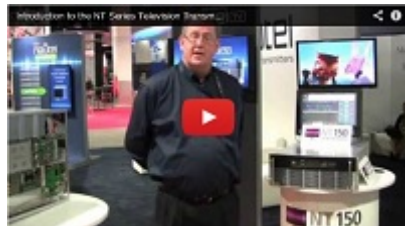
Digital UHF TV NT Series >